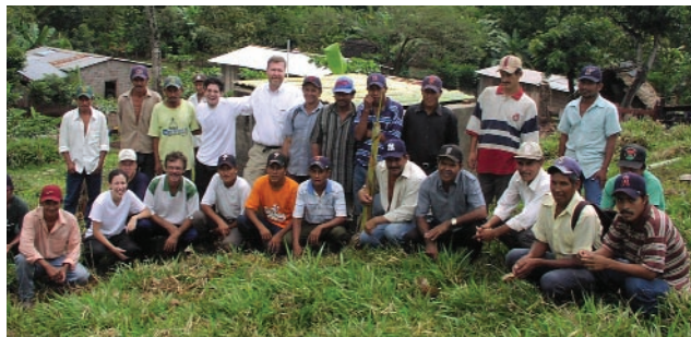
Villanova Assessment Team with the residents of El Guabo

they apply to the context of the situation in Nicaragua. The CEE department is also considering involvement in this program which would allow multidisciplinary collaboration.