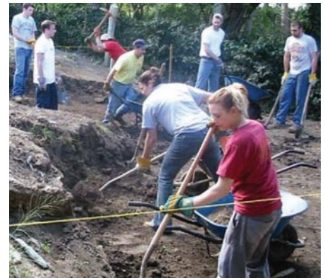
Working hard moving tons of dirt

While many of the engineering skills that they learned during their time at Villanova were implemented on this trip, the part that they will remember most is the boys of Amigos de Jesus. There were love, compassion and happy atmosphere whenever the boys were around. They were a fun loving group that needed no more than each other to be happy. The games they played involved paper airplanes, tennis balls, soccer balls or simply their hands. The most amazing part of the trip was each night when the group gathered in a circle for night prayers and the boys were so thankful for all that they have