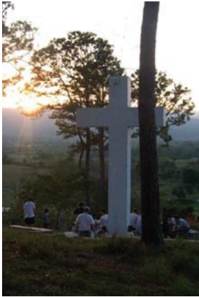
Sunset after a long day's work

There was once a young boy who was walking through the town, naked, beaten and starving. He was mocked and ridiculed until one person said, "look for the cross on the hill and there you will find hope."