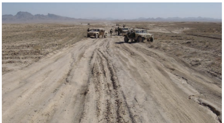
American forces on a typical Afghan road