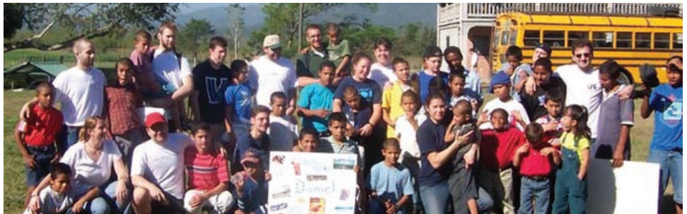
One family - Villanovans and the boys of Amigos de Jesus

been given. A lesson that the group learned was that it is not about materialism, but the community and happiness that they shared with one another. The boys at Amigos de Jesus have been given something that all of us were given when we were born, a reason to HOPE!!!